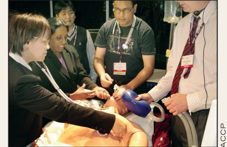
Simulation-based education enhanced lecture-based learning at CHEST 2006.

The educational format consisted of written pretests, an educational intervention, a simulation exercise, followed by a peer debrief and, lastly, a written posttest. Simulation-based education can serve as an enhancement to traditional lecture-based offerings that the ACCP has offered. Simulation provides a nonthreatening forum to practice, explore,