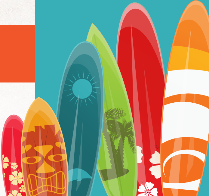
Exhibit hall opens