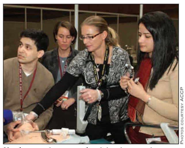
Meeting attendees appreciated the chance to learn new procedures through simulation.