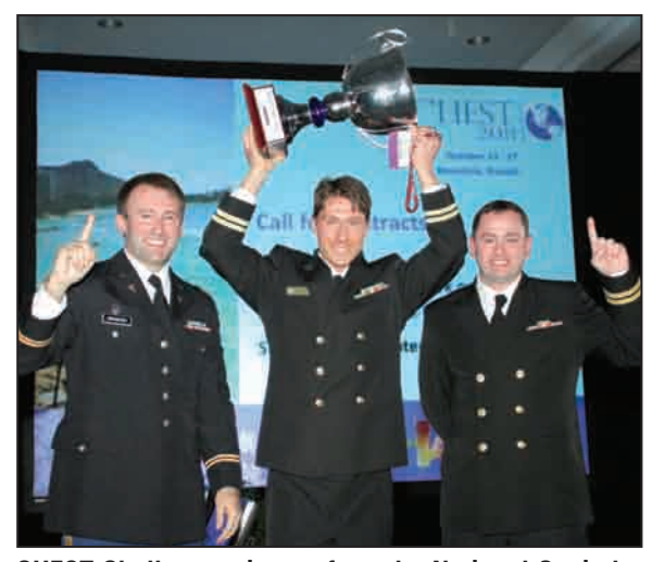
CHEST Challenge winners from the National Capital Consortium Pul/CC Fellowship Program.