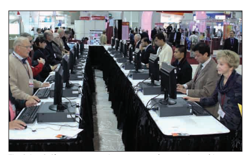
The Cyber Café gets more popular among meeting attendees with every passing year.

Pictures from CHEST 2010 are available for viewing and purchase at www.lagniappestudio. com/chest2010. Plan now to attend CHEST 2011, Oct. 22-27, in Honolulu, Hawaii.