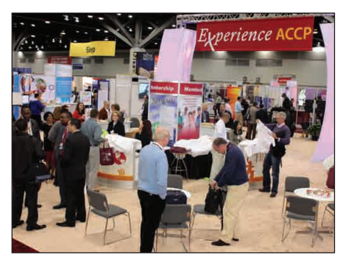
There was plenty of activity at Experience ACCP in the exhibit hall.