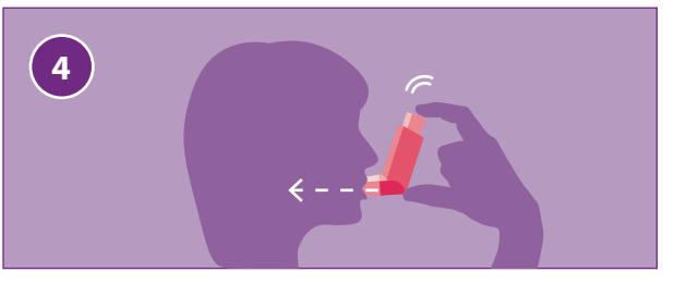
STEP 4: Begin to inhale slowly and then activate the inhaler a split second later. Keep inhaling slowly and steadily for 3 to 5 seconds or until your lungs are full.