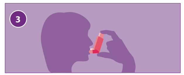
STEP 3: Hold the inhaler upright with the mouthpiece at the bottom and the top pointing up. Position it in or in front of your mouth. Be sure to keep your tongue out of the way of the spray.